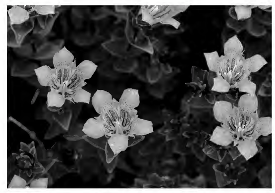
Explorer's gentian (Gentiana calycosa) near Upper Deadfall Lake Mount Eddy.